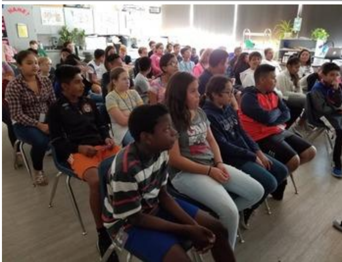
Students attending the Monarch education program.

94913, Lincoln, NE 68509-4913 or via e-mail to marilyn.tabor@nebraska.gov .