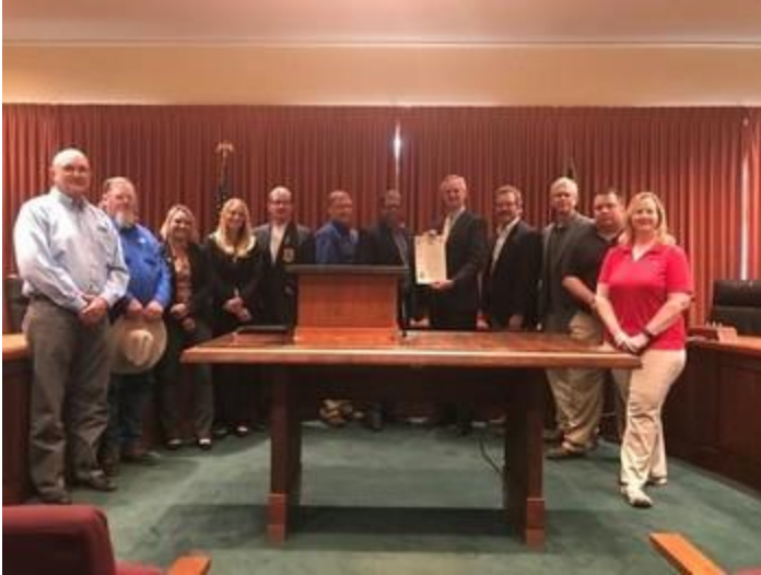
Lt. Governor Mike Foley, Senator Bruce Bostelman and members of conservation groups attending proclamation ceremony.